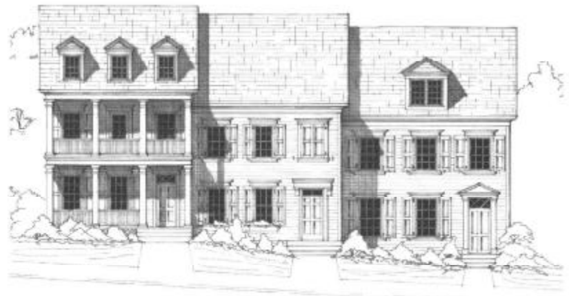
Elevation 2 Siding