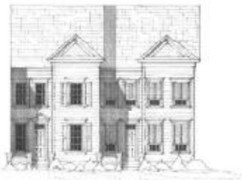
Elevation 4 Siding